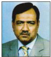
Nurul Islam Nahid M.P.